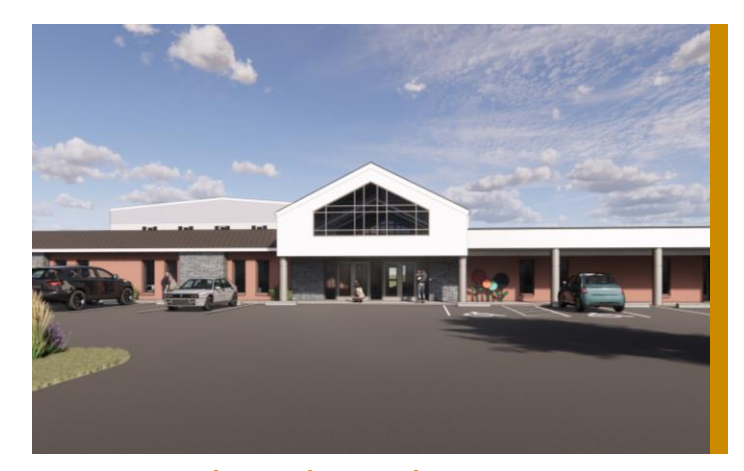
Beginning in 2026 Former Lancaster Mennonite School