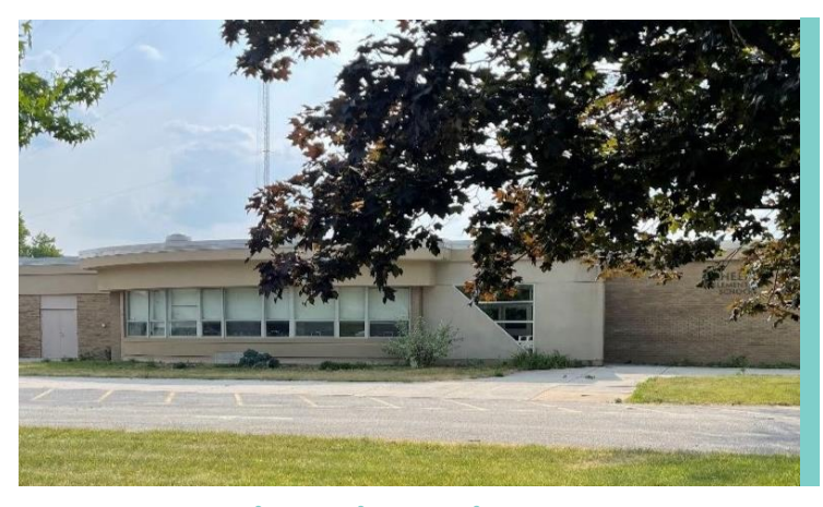
Beginning in 2026 Former Rheems Elementary School