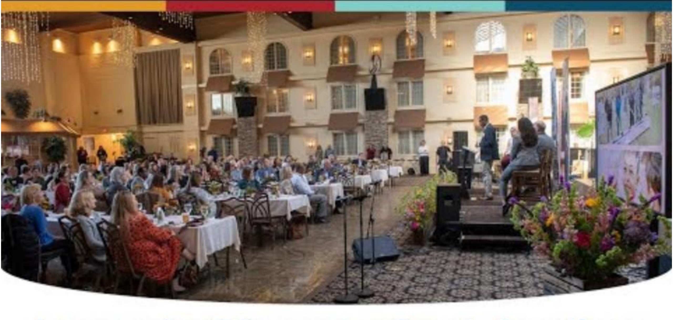
Announcing 3 Lancaster County Locations