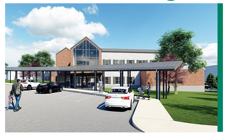
Opening in 2024 (under construction)